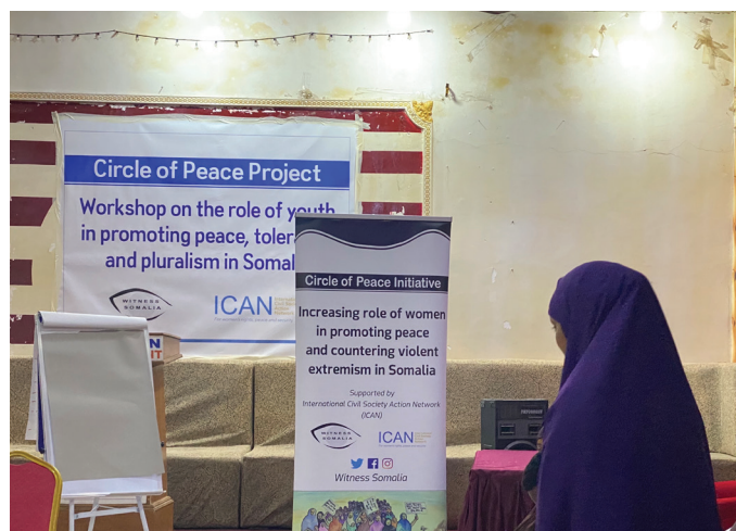
Witness Somalia provides safe spaces for women to share their experiences with the impact of violent extremism and discuss their roles in promoting peace and security

Weak government institutions, corruption, unemployment, and poverty are all drivers of extremism in Somalia. 3 Women experience high levels of violence, exacerbated by widespread impunity throughout the larger society. 4 Women have long been marginalized from political life and the public sphere through the rigid gender norms of cultural, religious, and clan-based traditions. 5 With worsening conditions of ongoing conflict, the economic incentive among other gendered experiences in Somalia can lead women to join Al-Shabaab. 6