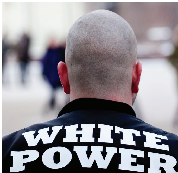
In Sweden, white extremist groups promote a specific image of maleness: a large, muscular, warrior archetype.

What motivates people to join white supremacist groups? One can consider individual grievances and psychological processes through a gender lens, for example. Notions of masculinity play a central role in recruitment to Sweden white supremacist groups. They promote a specific image of maleness: a large, muscular, warrior archetype, often heavily tattooed. Such an image might be attractive to men experiencing “aggrieved entitlement”: a gendered sense of entitlement thwarted by an experience of emasculation, which can stem from push factors such as being victimized or experiencing economic distress. 3 4 The image of a Viking is a common symbolic trope among Nordic white supremacist groups, representing untamed masculinity and connection to an armed brotherhood. Participation in white power groups offers these men a solution: a feeling of ideological superiority and moral authority over others,