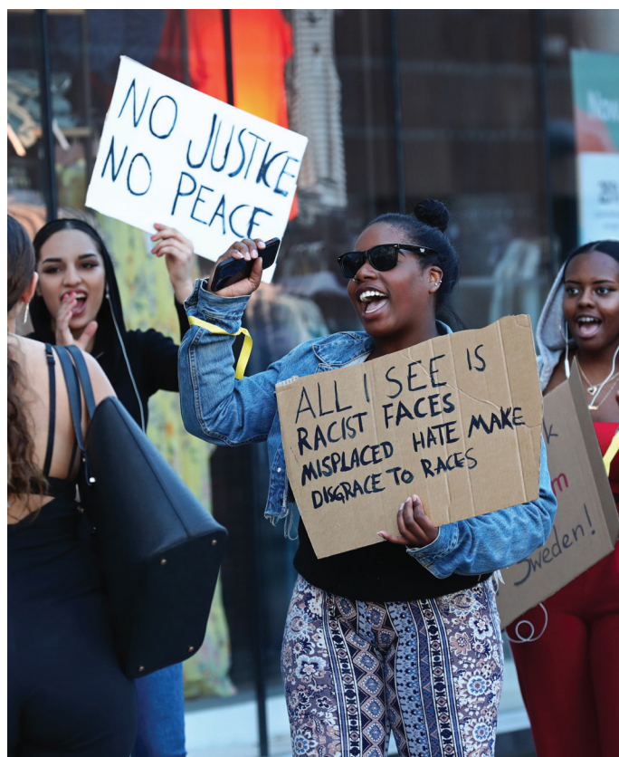
Pairing social and relational approaches with interventions that target the structural and political drivers of violent extremism and racism offers a new challenge for the Swedish context.

EXIT staff members (...) prompted client reflection on masculinity in the movement. As a result, clients were able to break down some of the constricting ideas around gender and masculinity that they had internalized.