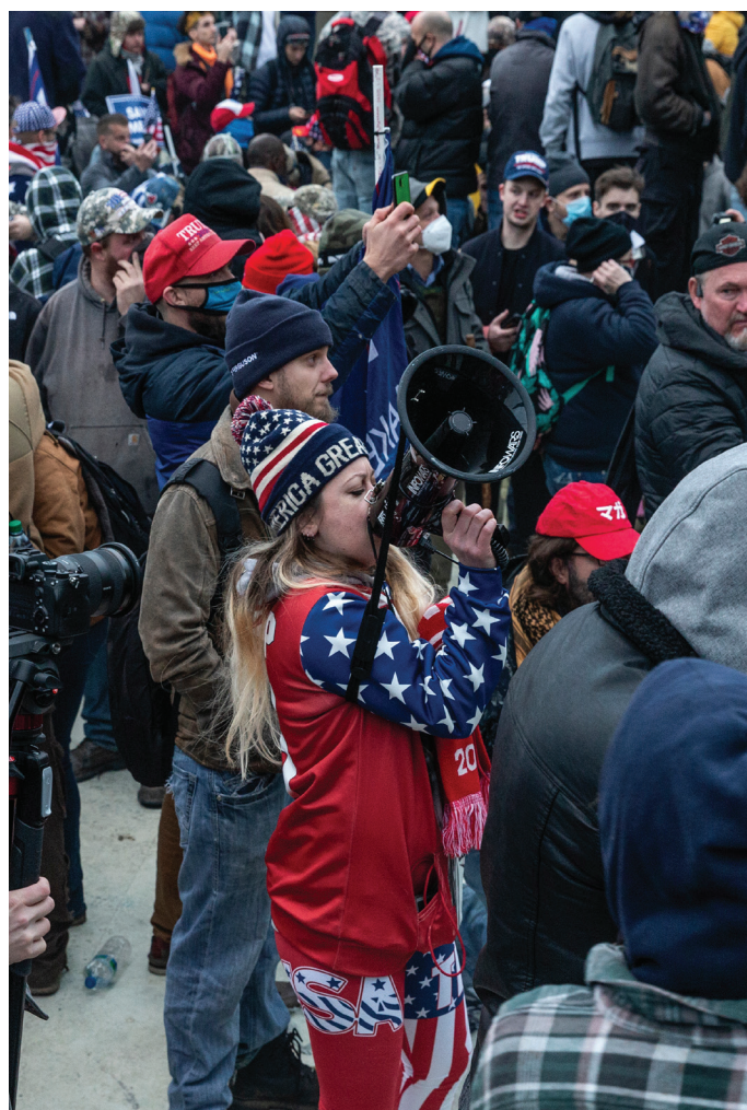
Women often functionally work towards amplifying white supremacist ideology and messaging.

White supremacy in the U.S. is heavily gendered, and its messaging and propaganda are imbued with themes of male supremacy and traditional gender roles, which offer simplicity. Such simplicity is appealing amid a changing and increasingly complex world that can exacerbate feelings of disempowerment, a lack of agency in men, and uncertainty of societal roles. This simplicity is also seen in the movement’s goals, which typically focus on racial protection, purity, and advancement. Women often functionally work towards amplifying white supremacist