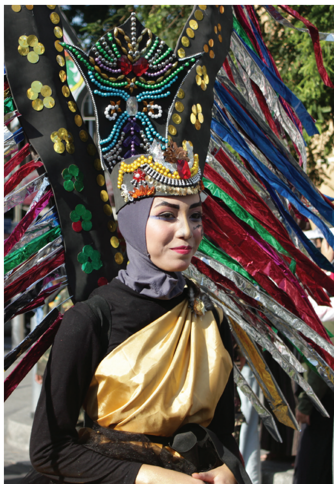
In Indonesia, the social authority of women ulama is recognized by the population because they are embedded in society through the pesantren.

Religious literacy, which can be a source of resilience to radicalization, is high in Indonesia thanks to the country's unique system of Islamic boarding schools called pesantren. Pesantren have been led by and produced female imams, intellectuals, expert Qur'an reciters and