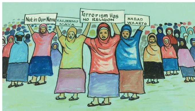
Witness Somalia recognizes art as a form of expression and understands the role of artists in raising public awareness around complex issues.

Witness Somalia has capitalized on art, music, drama, and sports to engage youth in alternative forms of expression and self-development.