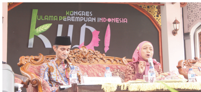
KUPI gathers women ulama from diverse institutions and organizations to advocate for gender justice and social justice.

2017 saw a marked advance in public recognition of women ulama, as a result of their consolidation through the first official convening of KUPI. In a groundbreaking step, KUPI issued three fatwas 9 focused on priority issues for Indonesian women: Sexual Violence, Child Marriage, and the Destruction of Nature. 10 These first three fatwas also provide a testing ground for the acceptance and impact of this claim to religious authority by women ulama. 11 The Congress also produced extensive recommendations addressing religious radicalism, violence, and conflict. These recommendations emphasize pluralism, critical thinking, supporting the nation-state, minority rights, following the rule of laws against hate speech, support