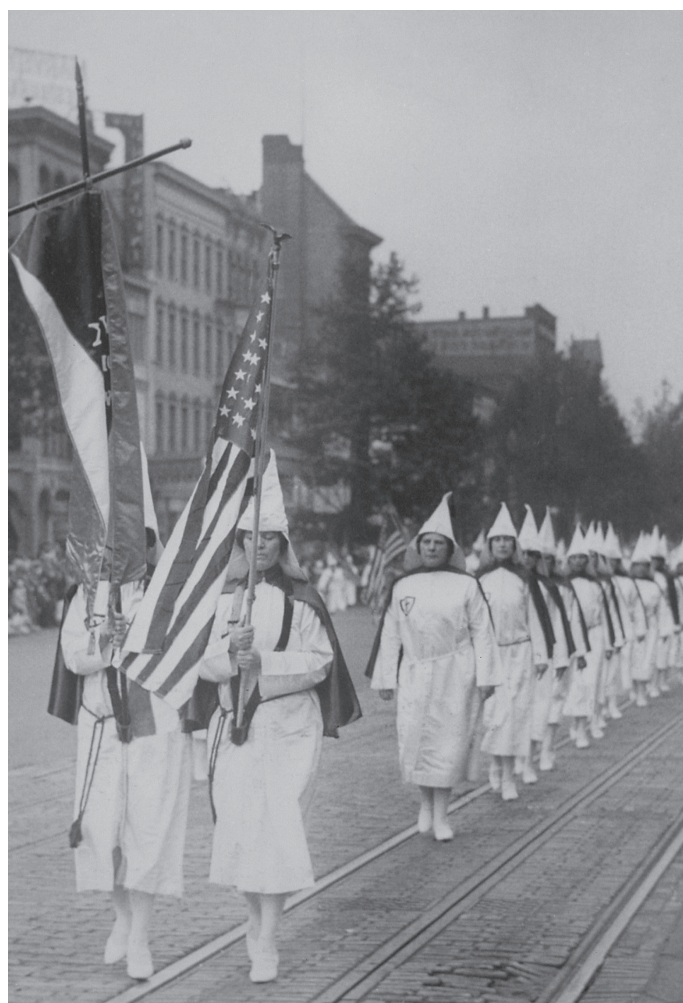
White women have historically played an integral part in white supremacy in the United States.

White supremacist violence also intersects with antisemitism, anti-immigration beliefs, and male supremacy. Periods of increased white supremacist-motivated violence ebb and flow cyclically. The United States is currently experiencing an intensifying period of white supremacist violence. This violence is spread across all age demographics, from teenagers to baby boomers, and spans all economic demographics. However, those under 25 are overrepresented in online-driven, accelerationist, neo-Nazi affiliated groups. Militia and separatist groups tend to attract 25- to 50-year-olds, and adherents to conspiracy-driven affiliations such as QAnon tend to be heavily populated by those 35 and over.