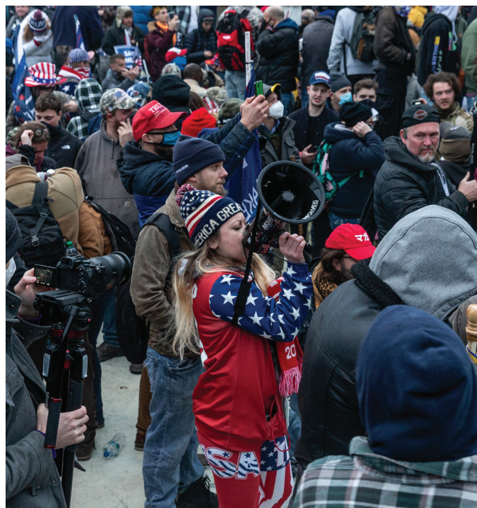
Women often functionally work towards amplifying, marketing, and mainstreaming the messaging of white supremacist ideology.

Abused people often become abusers. Research shows that the highest indicator that someone will act out violently is a history of experiencing violence to effectively solve problems earlier in life, as a victim, witness, or perpetrator. 11 Most mass shooters have a history of violence