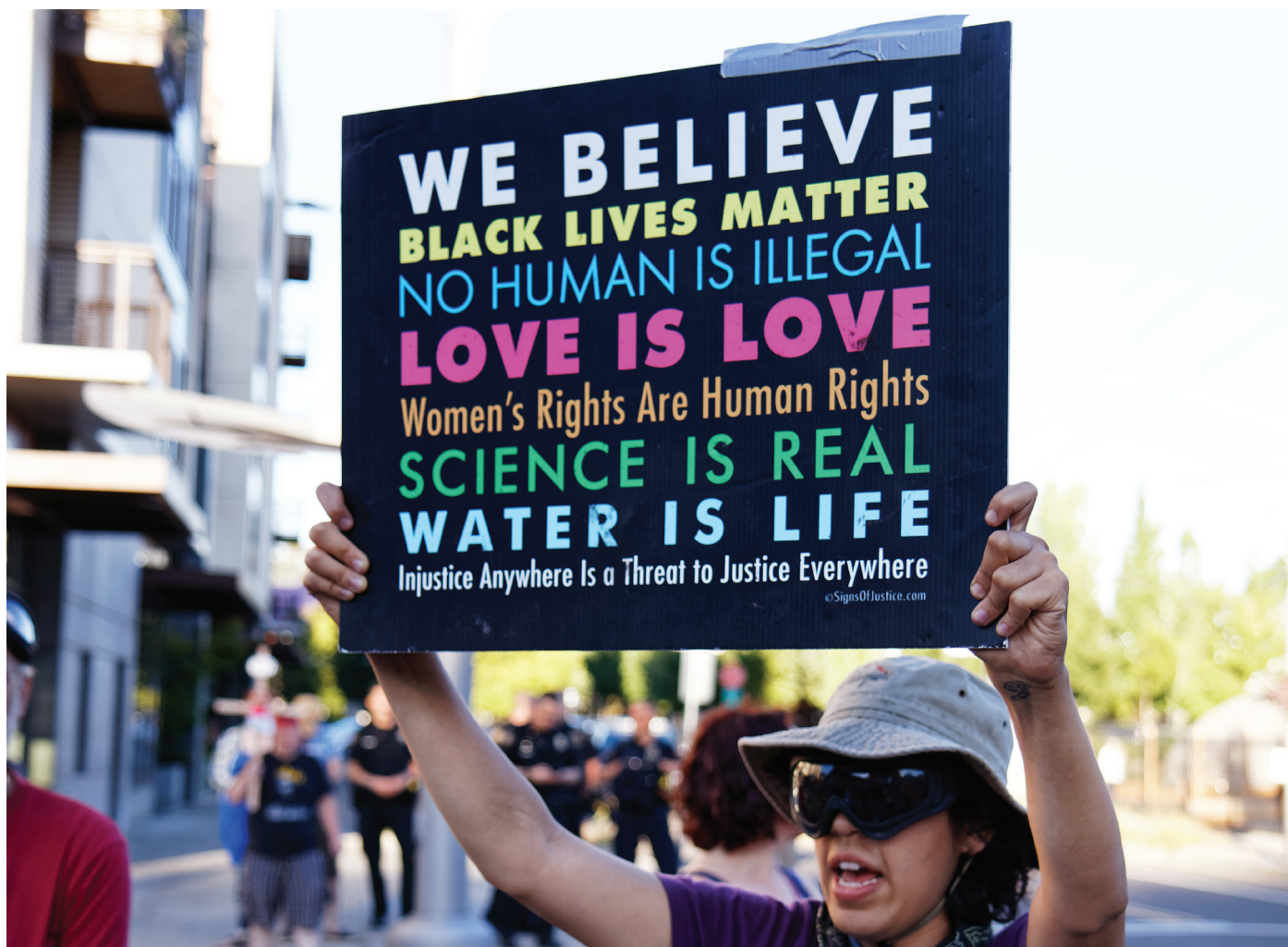
Encouraging engagement in pluralistic philosophical and political discourse can help people have a wider view and greater empathy for the struggles of many communities.

Learning necessary, healthy boundary-setting skills assists women in developing healthier relationships and beginning the process of cultivating an identity of their own, outside of their interpersonal relationships.