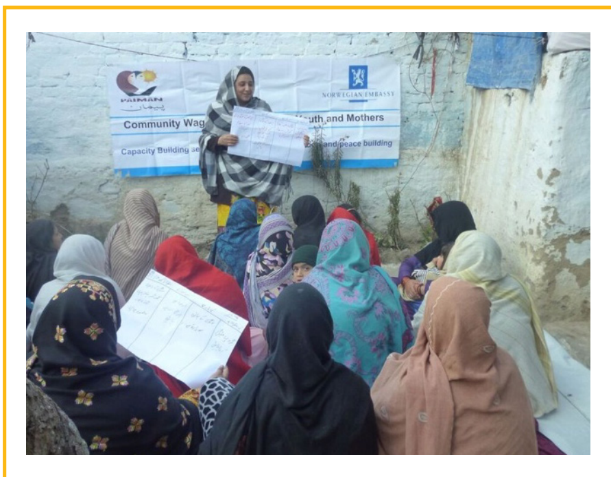
Women learning to notice and address signs of radicalization during a PAIMAN training

This range of complex issues is exacerbated by gaps between the world of counter-terrorism practitioners, law enforcement and experts in the realm of reintegration and rehabilitation of returnees within and across national boundaries. As one former senior European government official noted, "All the countries grappling with the national legal framework also have to deal with the transnational phenomenon. There are international frameworks, but we need more unity and discussion across countries and sectors to speak the same language and understand better how legal frameworks are being implemented." 122