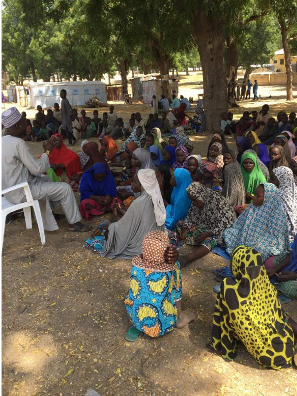
Women and children affected by Boko Haram in northeast Nigeria